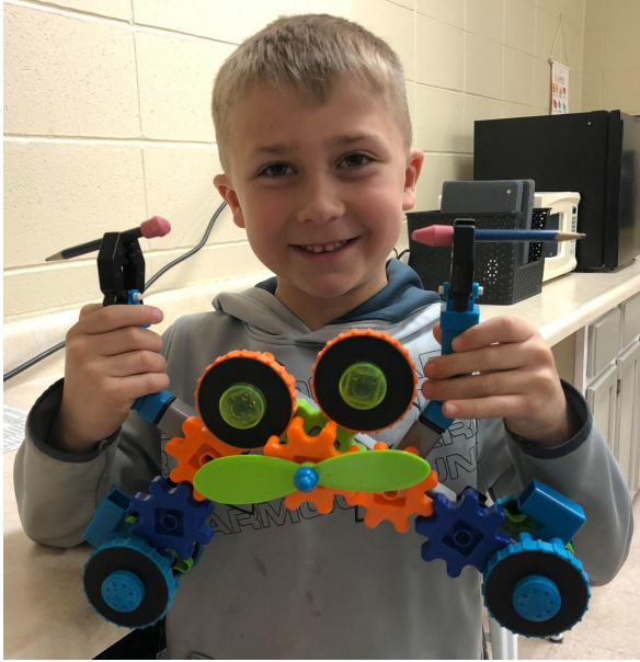
Robots in Kindergarten!